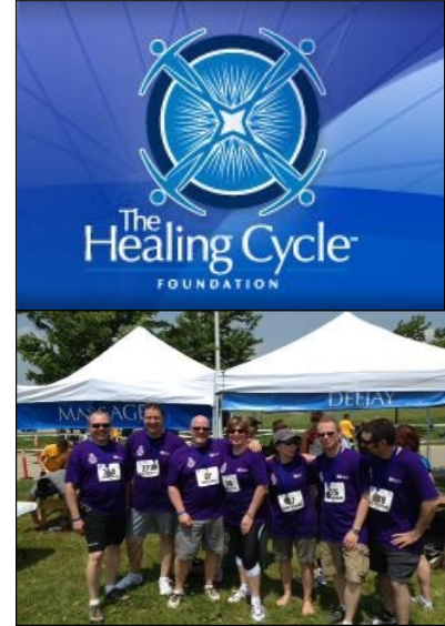
Healing Cycle Ride June 22 nd 2014